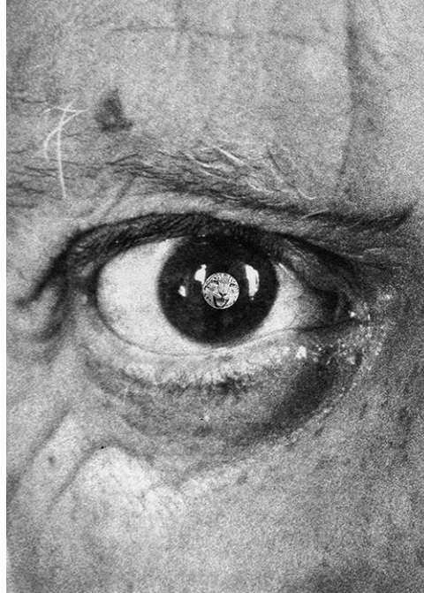
Image: Alasdair McLuckie, Study , 2015, archival Inkjet print on paper, 42 x 30cm.

practice – the spontaneous with the painstakingly laborious – as bold two and three-dimensional compositions.