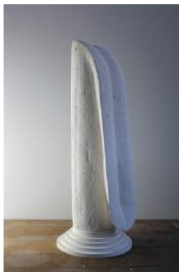
Pollinator , 2015 Carved lightweight concrete and cast plaster base, 25 x 25 x 58 cm. $2000