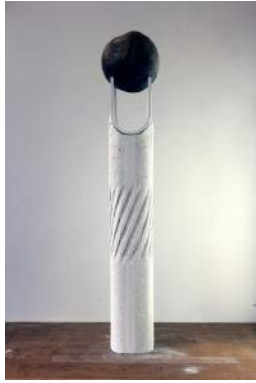
Civil Bodies III , 2015 Plaster, lightweight concrete and found plant matter, 10 x 10 x 75 cm. $1550