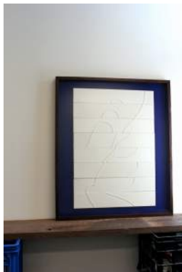
Salamander as a Child , 2014 Plaster on acrylic with wooden frame, 69 x 82 cm. POA