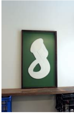
Salamander , 2014 Plaster on acrylic with wooden frame 86 x 53 cm. $2100