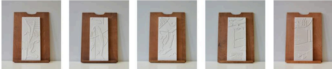
The Scorpion Sonatas , 2014, Plaster reliefs on plywood ledgers. Plaster reliefs 14 x 33 x 1cm, plywood ledgers 28 x 38 x 4cm. $5000 (set of 5)