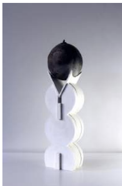
Civil Bodies II , 2014 Plaster and found plant matter, 12 x 10 x 38 cm. $1650