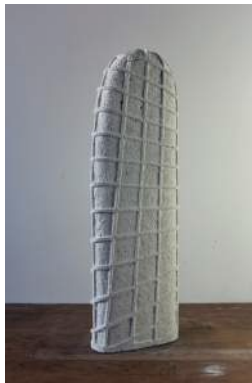
Sonnet , 2015 Carved lightweight concrete, 5 x 15 x 50 cm. $1750