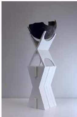
Civil Bodies I , 2014 Plaster and found plant matter, 12 x 12 x 45 cm. $1650