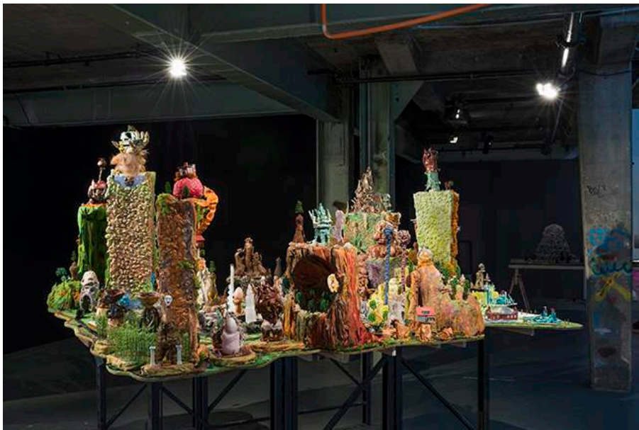
Emily Hunt, Doctrine of Eternal Recurrence , 2014. Mediums: plaster, ceramics, plastic, found objects, enamel paint. 2.4 metres by 2.4 metres.

'das schwerste Gewicht', or the heaviest weight , builds on the 'Doctrine of Eternal Recurrence'. This took the form of a large, kinetic train set that, in spite of its wholly fantastic appearance, evokes a disconcerting set of parallels between a fictional world and our own.