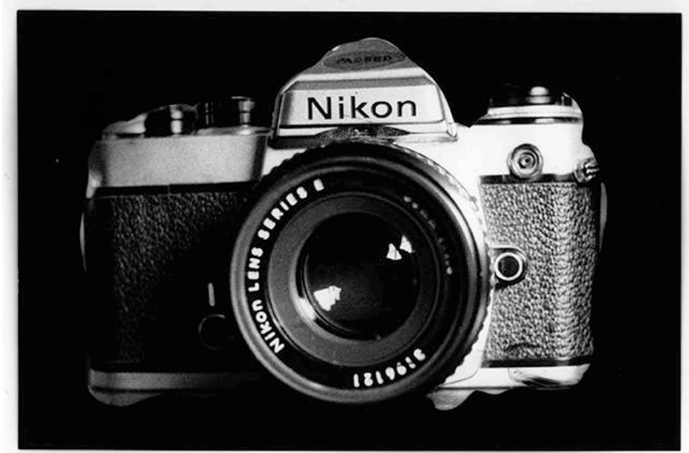
Image: Benjamin Lichtenstein, Untitled , 2015, unique silver gelatin print, 14 x 21cm.

The project centres on creative interplay as the artists have collaborated over time – via painting en plein air , email correspondence or trading reference materials in the post – to explore possibilities borne out of artistic exchange. Though varied in age and experience, artists have been paired on the grounds of mutual sensibilities – however subtle – like material choices, affection for colour, composition or the willingness to experiment.