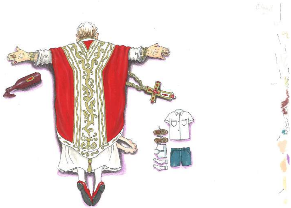
Image: Mary Leunig, Untitled , 2014, Pen, ink and watercolour on archival paper, 20 cm x 20 cm.