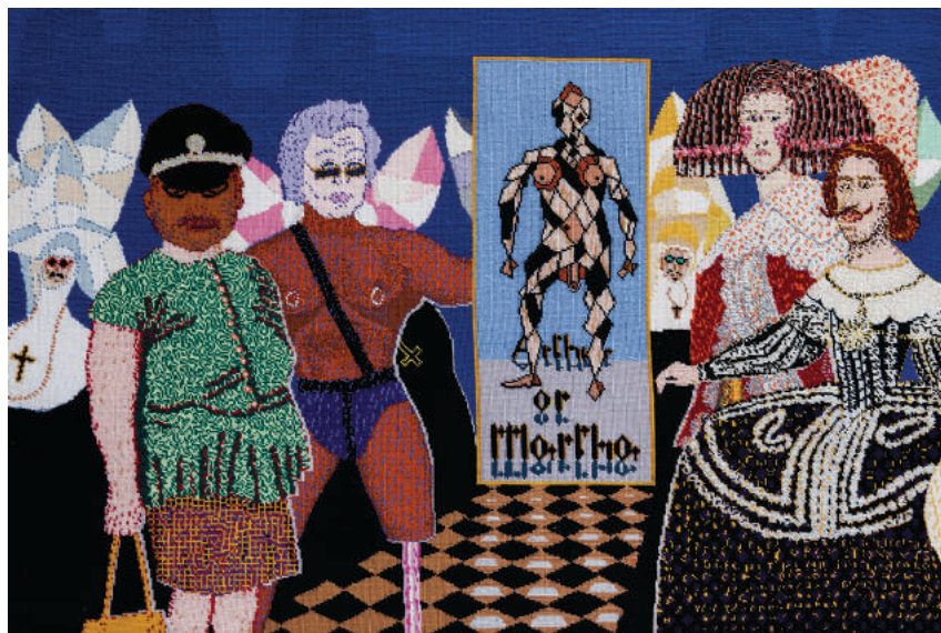
Image: Robert Brain, Mardi Gras , 2012, pure wool, 100 x 140 cm.

The artworks included in Needleman, Feminist Fan engage subjectively with historically loaded art making techniques and gender politics; conveying the autobiography of each artist, who use thread in a way that transcends the material qualities of their craft through significant performative gestures.